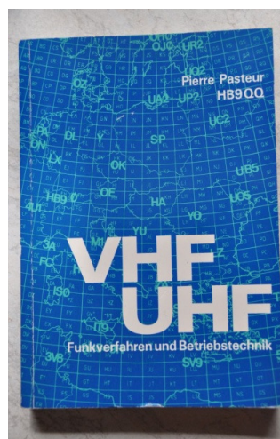
His book, his legacy