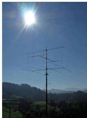
Sternenberg: Pierre's big guns for 18 und 50 MHz